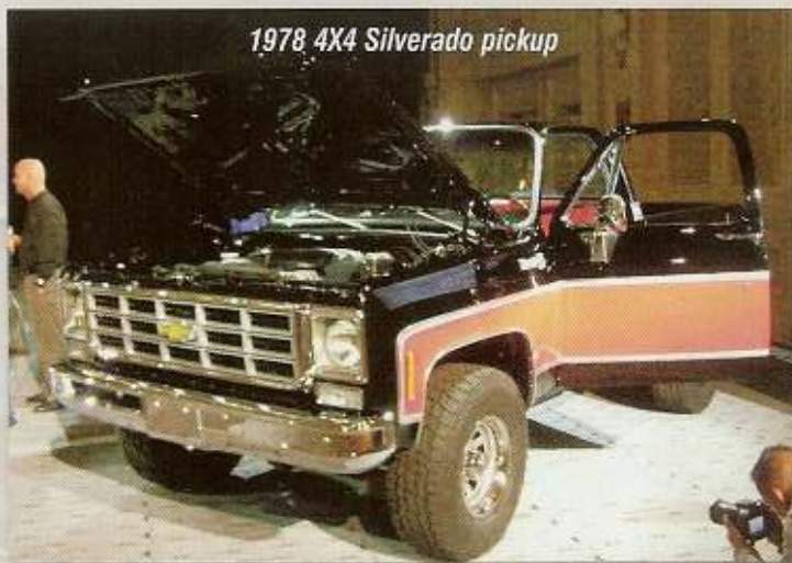
1978 4X4 Silverado pickup

There are literally thousands of cars to admire, whether in a vendor booth, along a walkway or out front of the convention center on an asphalt lot. Each year GM issues awards to cars and products that they feel were exceptional. One of the recipients at the Craftsman tool booth was a lowered 1969 Chevrolet C-10 truck shod with a Roadster Shop chassis, Wilwood brakes and a fuel injected engine.