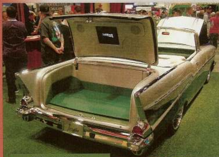
PPG paint display