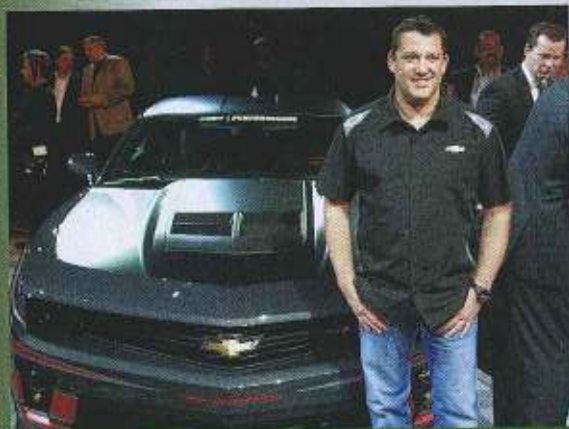
Tony Stewart with his ZL1 Camaro

The biggest trade show in Vegas wows the crowds again with record-setting vendor participation and attendance.