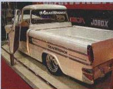
Gear Wrench display