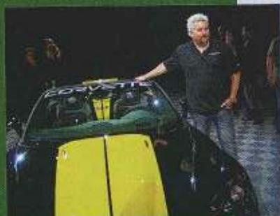
Guy Fieri from the Food Network with his Corvette